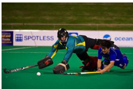
Super 9's Aus vs Korea 2013