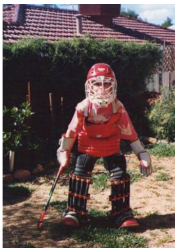
"Dare to Dream"